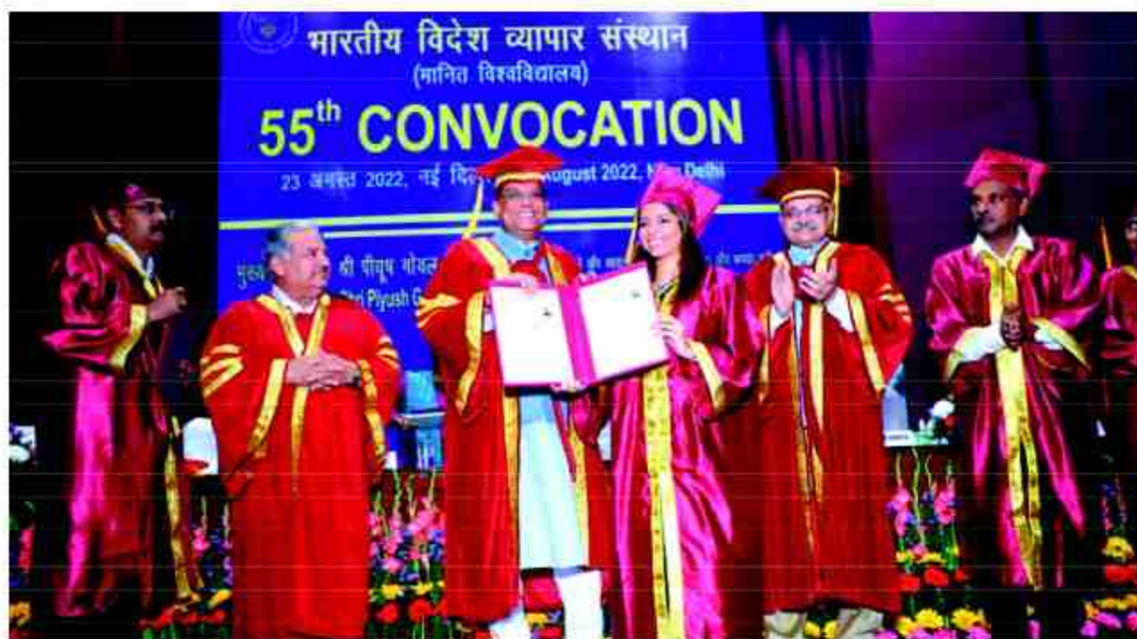
Shri Piyush Goyal, Minister of Commerce & Industry, Consumer Affairs and Food & Public Distribution and Textiles, Government of India, awarded Degree at 55 th Convocation on 23 August 2022.