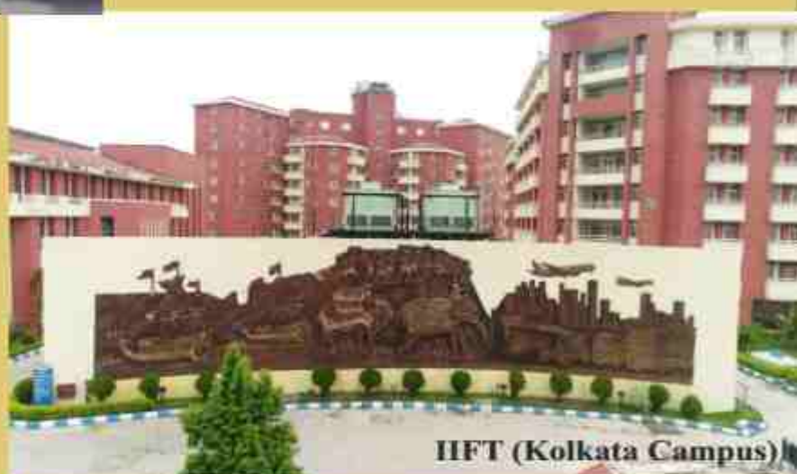
IIFT (Kolkata Campus)

INDIAN INSTITUTE OF FOREIGN TRADE (DEEMED TO BE UNIVERSITY)