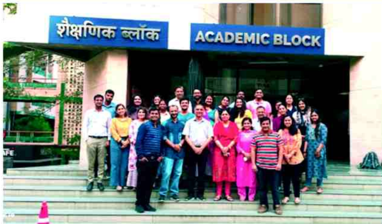
Two Days Workshop on Qualitative Methods using 'R' during 7-8 May 2022.