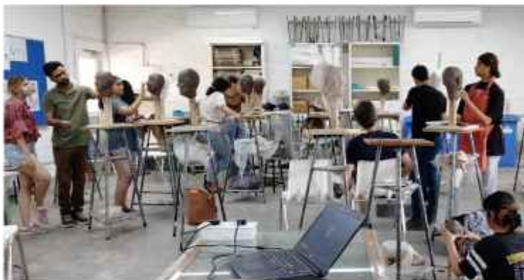
Sculpture and Carpentry

In the last year, the program has constructed 4 studio spaces: