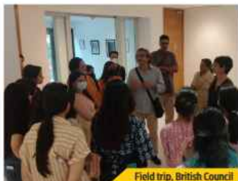
Field trip, British Council