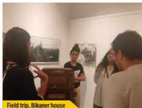
Field trip, Bikaner house