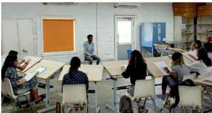
Painting and Drawing