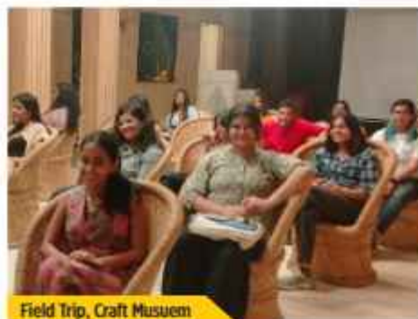
Field Trip, Craft Museum