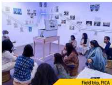
Field trip, FICA