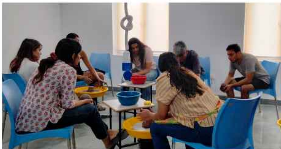
Pottery and Ceramics