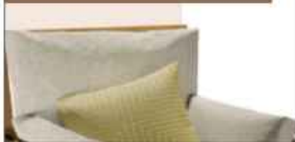
Meenakshi V, 4th year, Interior Environments Jindal Pathway

The 'Zephyr' inspired from classic and contemporary furniture adds a minimalist and chic look to your Living Room. With sleek, geometric forms; it captures a light and breezy feel, while also retaining it's provenance.