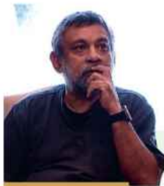
Pablo Bartholomew, Award-winning Photojournalist, Photography workshops at JSJC