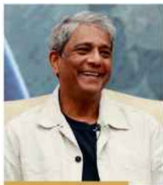
Adil Hussain, Award-winning actor, JSJC masterclass class on 18th September 2023