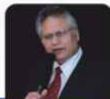
MR. SHIV KHERA

International Author & Motivational Speaker