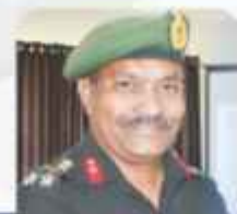
HON. BRIG. SUNIL BOODE

Customs, Indirect Taxes (CST) & Narcotics