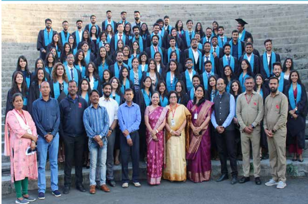
Convocation Batch 2020-2022

* Few seats are reserved as Discretionary Quota Seats. Only students with good academic record and with good entrance test scores are considered for Discretionary Quota Seats. The fees for Discretionary Quota seats will be double the academic fees of open category as approved by the Fee Structure Committee, to be paid to the institute by way of online transfer/demand draft. Once admission is taken in Discretionary Quota, the fees applicable to Discretionary Quota will have to be paid by the student for the entire duration of the programme. No donation or capitation fee is charged for admission to any program at any institute of SIU