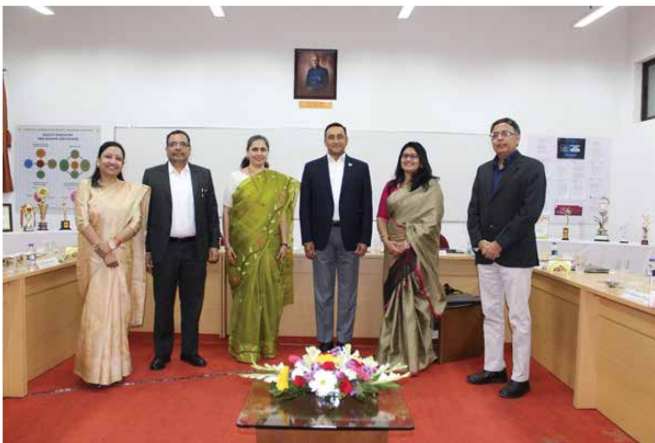
Advisory Board Meeting