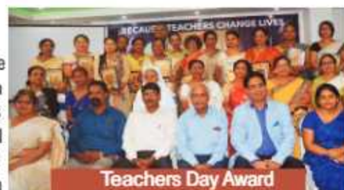
Teachers Day Award

The thing that sets the IAM'ites apart in the professional arena is the confidence and ease with they face every situation. This is developed through rigorous on the job evaluation right from year one. The numerous Hospitality events specially in the area of food and beverage service prepares the students for real guest handling situations. At every level of study there are theme parties, food festival, banquets which not only hone their practical skills but also sharpen their managerial abilities. Most of the time such events are organized under the guidance of celebrity chefs / industry / professionals whose professional skills and expertise is an inspiration in itself. Besides this anticipating guest needs and addressing guest complaints provides a strong foundation for the underlying ethos of the Hospitality Industry. Working long and irregular hours with a spontaneous smile comes easily to them and makes them industry ready.