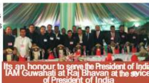
It's an honour to serve the President of India IAM Guwahati at Raj Bhavan at the service of President of India