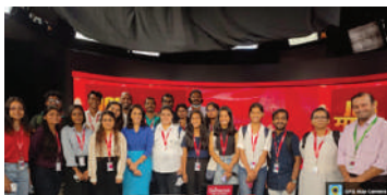
Visit to ABP NEWS organised by Mass Communication Department