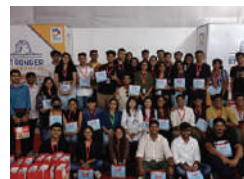
Students of Business Studies Department visited Go Cheese