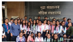
Students of Banking and Finance visited RBI Monetary Museum