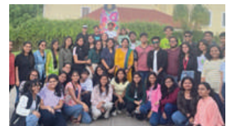
Students of Biotechnology Department visited Sula Wines and Advanced Enzymes Ltd.