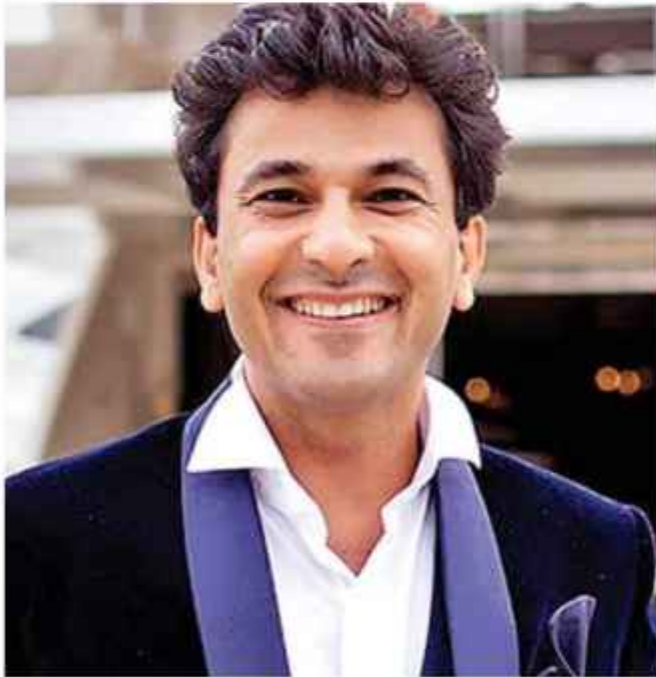
Vikas Khanna Michelin Star Chef