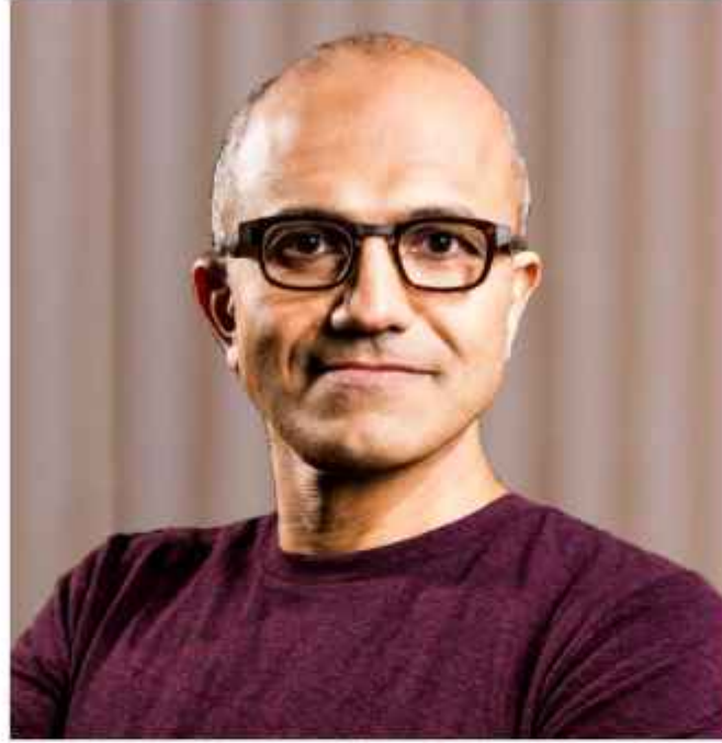
Satya nadella CEO, Microsoft