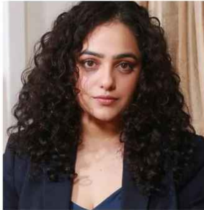
Nithya Menen Indian Actress