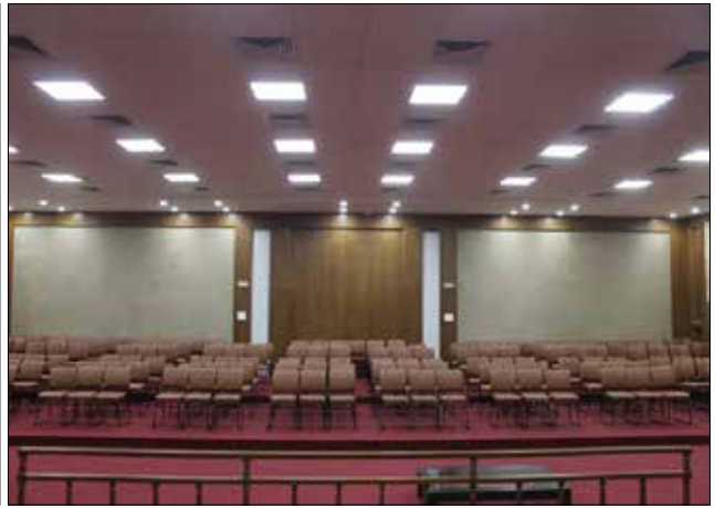
Moot Court Hall