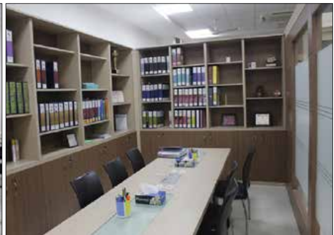
Research & Publication-Conference Room