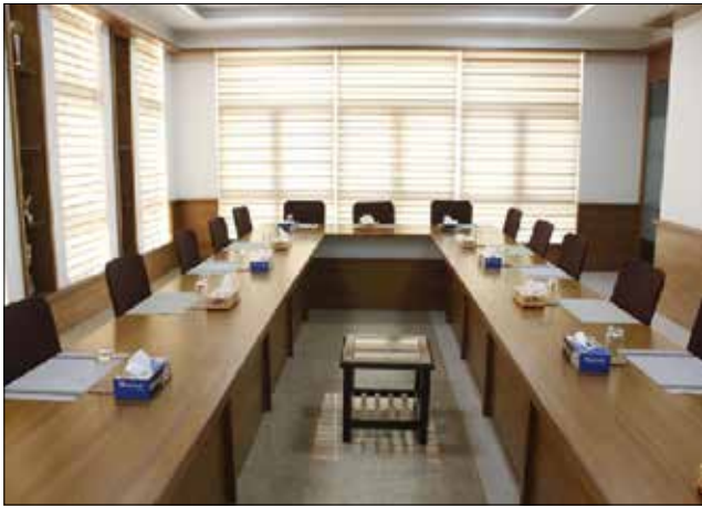
Director – Conference Room