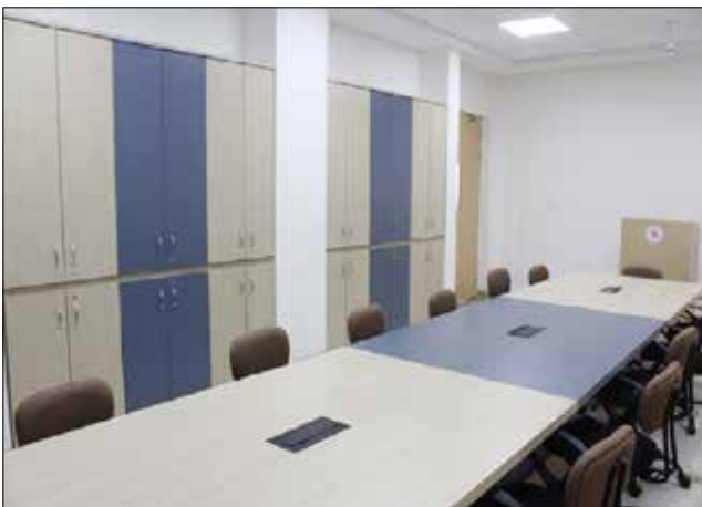
Student Activity Room